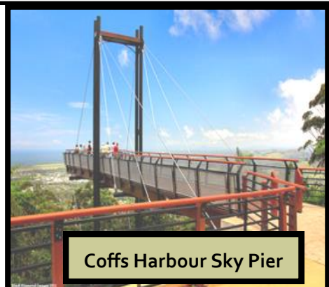
Coffs Harbour Sky Pier

We board the coach and head north to Coffs Harbour , up to Sealy Lookout which lies within Bruxner Park Flora Reserve . The Forest Sky Pier offers visitors an amazing 180 degree view over the Coffs Harbour Coastline . After morning tea we take a country side drive and arrive at Woolgoolga or as the locals call it “... Woopi ” Here we have some shopping time as well as a tour of the town which also consists of the newly built “ Sikh Temple of Australia ” After lunch we make our way back to Macksville