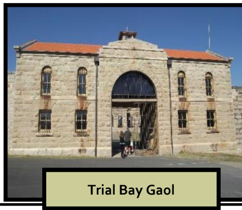
Trial Bay Gaol