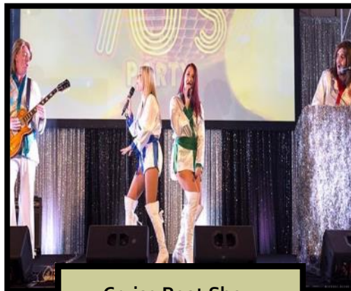
Cruise Boat Show